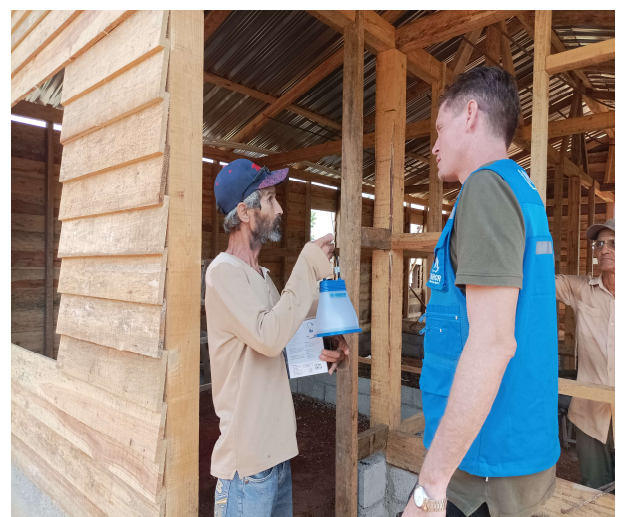
UNHCR distributed 19,628 solar lamps and 140 tents to those affected by the category 3 Hurricane Ian in Pinar del Río.