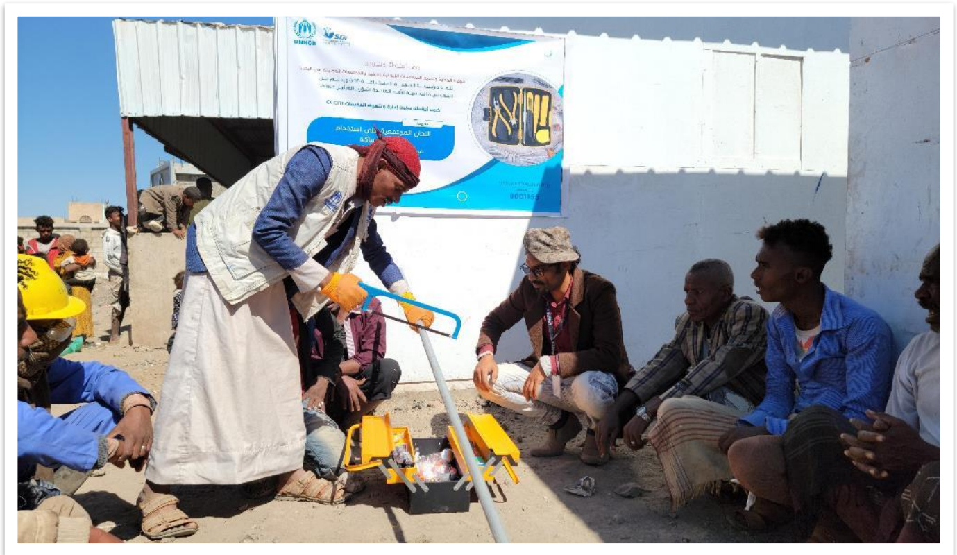
IDPs at the Al-Judad site in Dhamar Governorate received a plumbing box as part of the UNHCR-funded SDF-CCCM site maintenance project activities. All needed to maintain and repair the water points and latrines on the site are contained in the plumbing box. A brief description of the box's contents and how to utilize it was provided by a plumbing expert on the site. The community committee will be in charge of the plumbing box on 21/12/2022.