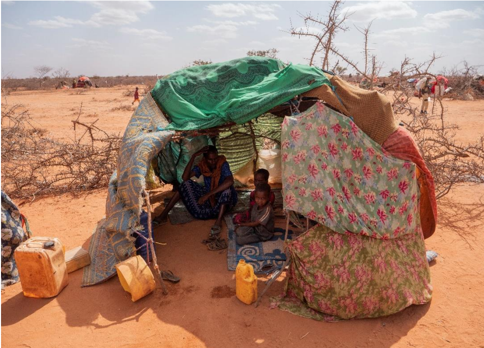
Thousands of people in Somalia have been forced to flee their homes in search of humanitarian assistance including food, shelter and safe drinking water.

UNHCR has been responding to the drought with lifesaving shelter and CRI assistance . Some 141,290 IDPs and host communities have received Core Relief Items (CRIs), which are comprised of basic household items, such as kitchen sets, blankets, and jerry cans, either in cash or in-kind. More than 33,000 IDPs have benefited from in-kind or monetized emergency shelter support.