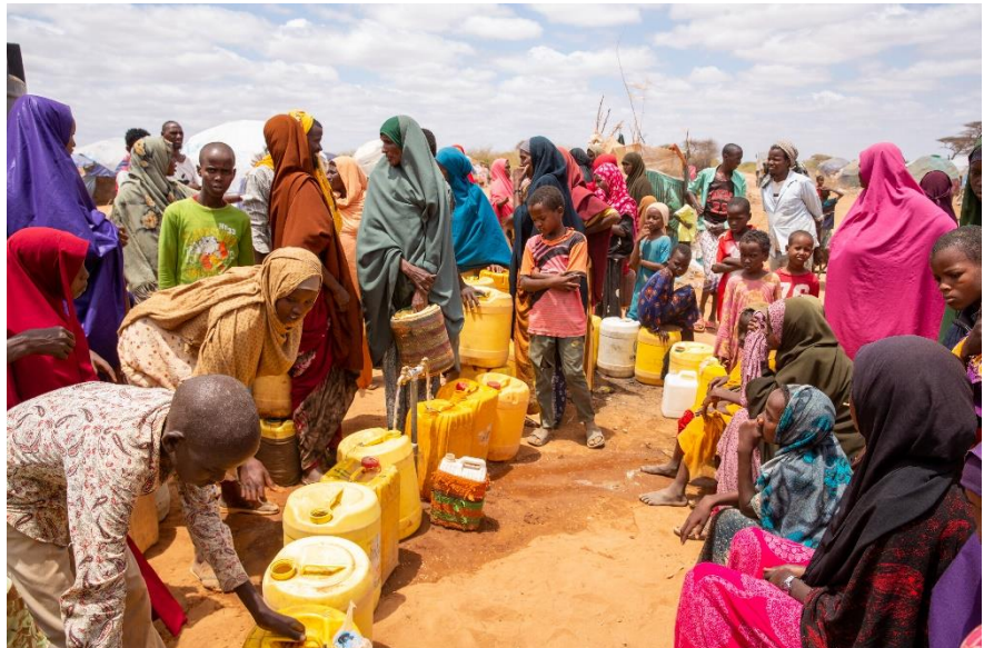
New arrivals from Somalia line up to fetch water tank at Dagahaley in Dadaab, Kenya.

UNHCR and partners have conducted vulnerability screenings to assess various specific needs of the asylum-seeker population yet to be profiled. This will enable timely assistance to the right population during the drought response. Currently, 2,645 persons with specific needs (PSNs) have been assessed for support.