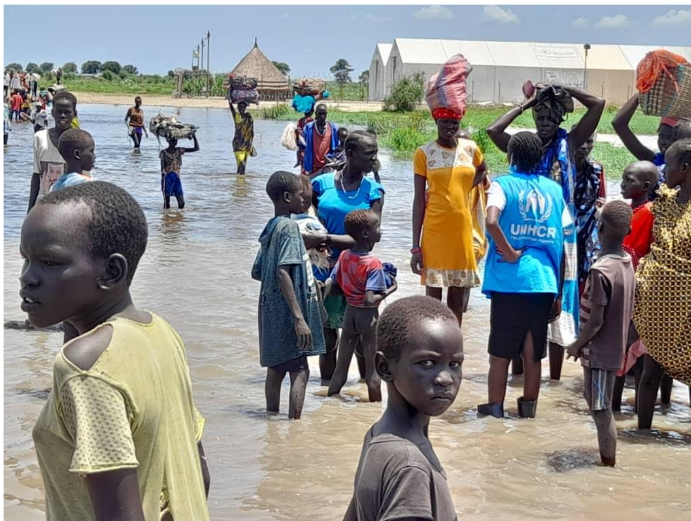
Flood affected communities in Rubkona County, Unity State, South Sudan.