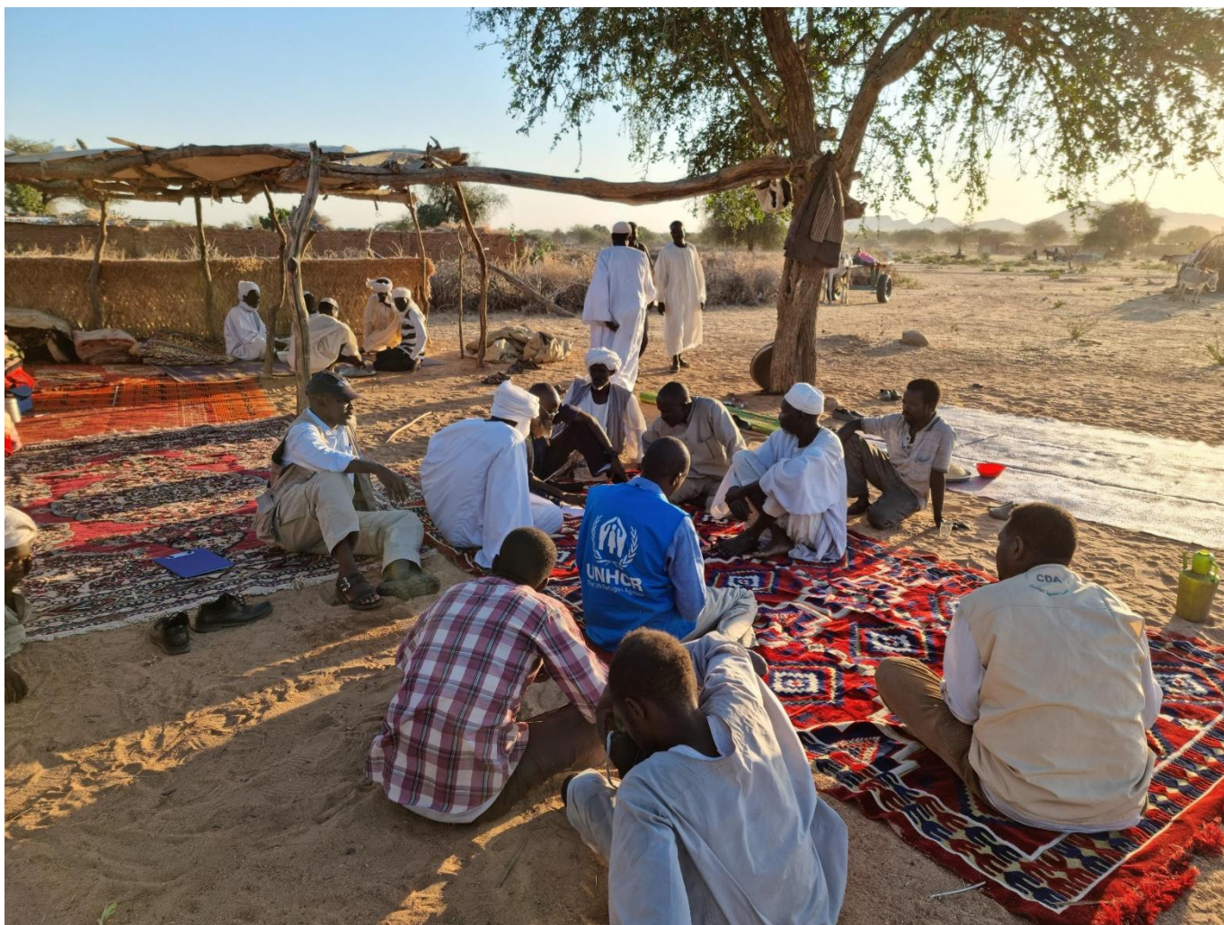
Intercommunal violence broke out in the mountainous Jebel Moon region of West Darfur, Sudan on 16 November 2021, which displaced thousands of people, including across the border into Chad. UNHCR participated in an inter-agency mission to the area between 29 November and 2 December 2021 to assess the needs of those who had lost homes and belongings.