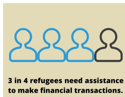
Figure 6 – Proportion of refugees without digital financial literacy