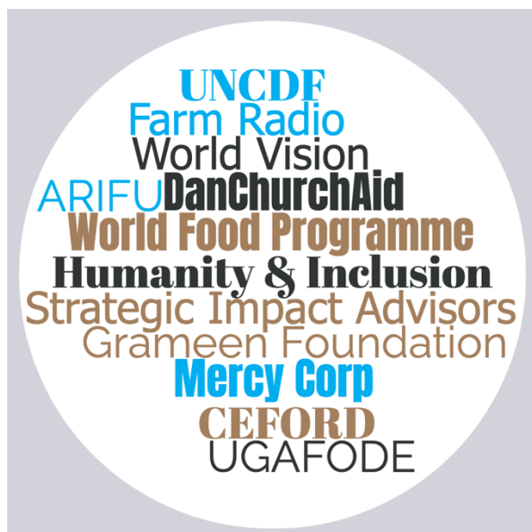
Figure 7 – Actors implementing FLT (as self-reported during the DFLT webinar )

The DFLT webinar identified that the following organisations in Uganda are currently providing some aspects of DFLT: Mercy Corps, Farm Radio, UGAFODE, CEFORD, DanChurchAid, SIA Edge, and Grameen Foundation.