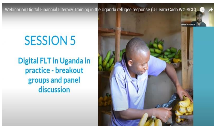
Figure 1 – Screenshot of webinar on Digital Financial Literacy in Uganda

In July 2021, a Learning Review on Financial Literacy Training (FLT) commenced. It collated and curated existing FLT experiences and evidence from the Uganda refugee context, and culminated in a learning brief . That FLT learning review highlighted the need for more in-depth research on digital FLT (DFLT), building on the existing FLT materials and knowledge. Thus, in collaboration with the Uganda Inter-Agency Cash Working Group, Mastercard and USAID-led Smart Communities Coalition (SCC), a DFLT learning review was undertaken.