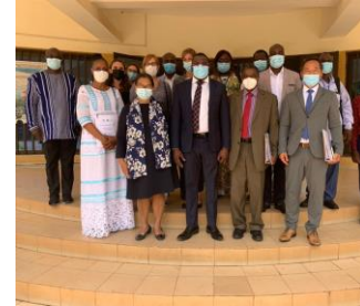
Family photo after the meeting between the IDP expert group and the cabinet of the MFSNFAH.