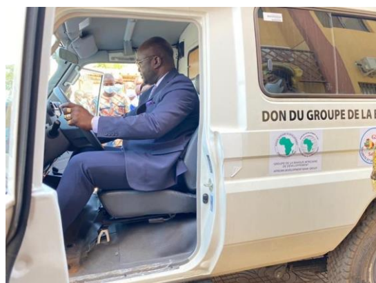
The Minister of Health of Burkina Faso, testing one of the medical ambulances received by his department.