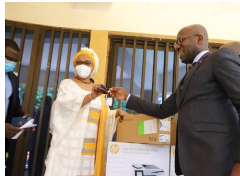
UNHCR representative symbolically handing over the keys of the distributed motorcycles to the MFSNFAH.