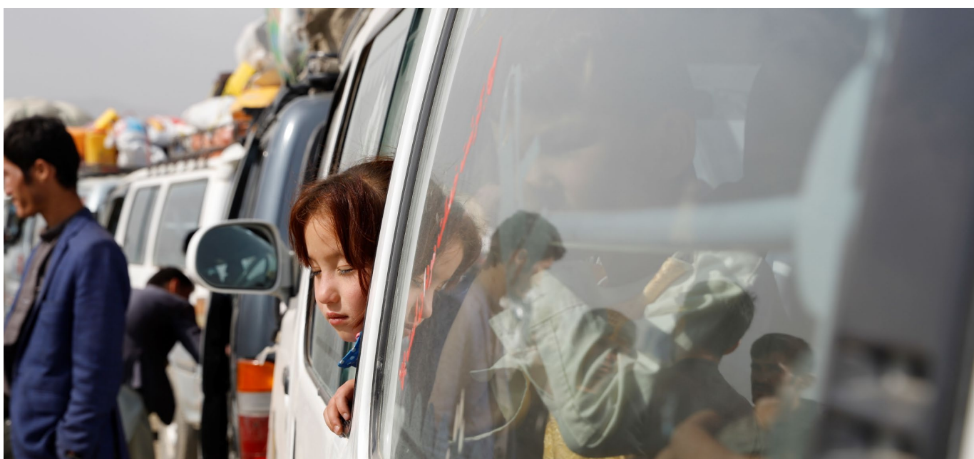
IDP families being supported to return by UNHCR in Paghman district, Afghanistan.