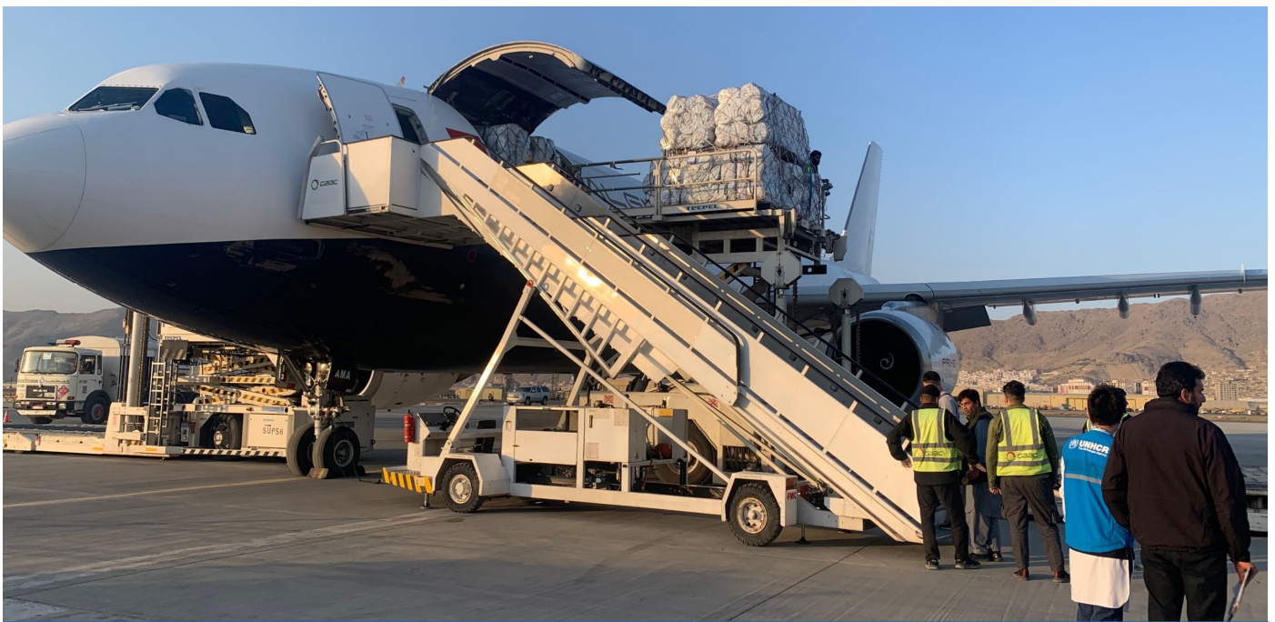
Arrival of first UNHCR airlift from Dubai to Kabul airport of winterization shelter assistance.