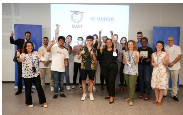
DAFI scholarship agreements' signing event at UNHCR in Belgrade

In August, the Asylum Office (AO) of the Ministry of Interior of Serbia made no recognitions but rejected two applications by nationals of Cuba and Syria. In August, 237 expressed intention to seek asylum in Serbia and eight submitted actual applications. 1,315 asylum-seekers newly arrived in asylum centres in August, and 1,196 asylum-seekers absconded from them. By end-August, AO has granted subsidiary protection to six and refugee status to three persons in 2021.