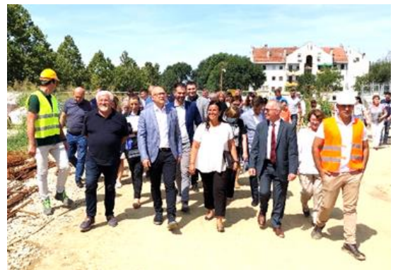
Mayor of Novi Sad, UNHCR Representative, OSCE Mission to Serbia representative at the RHP construction site in Veternik

Together with mayor of Novi Sad, OSCE Mission to Serbia and SCRM representatives, UNHCR Representative visited on 4 August the construction site of accommodation for refugees in Veternik in Novi Sad, one of the biggest sites within the Regional Housing Programme (RHP) . "More than 5,800 refugee families have so far got not only their homes, but also an opportunity for a decent life through the RHP", said UNHCR Representative to present media.