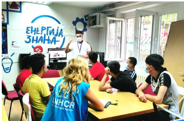
Peer Educator Workshop for UASC, implemented by CRPC, Niš

UNHCR partner Crisis Response and Policy Centre (CRPC) procured a car-mechanic course to an asylum seeker from Burundi and accounting course for two refugees from Cuba and Burundi. An extremely vulnerable refugee from Nigeria was provided with food assistance.