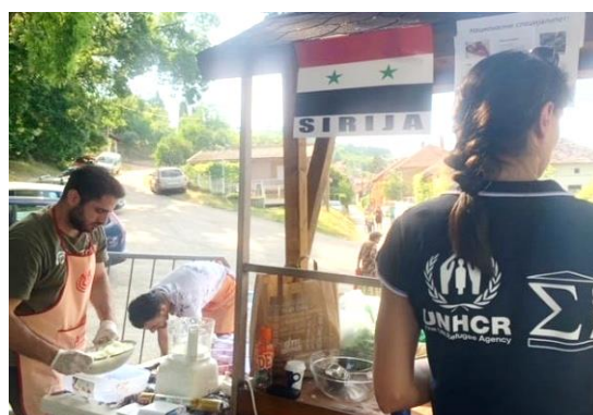
The team from Syria presents their national dishes at Days of Banica food festival in Bela Palanka, Serbia

UNHCR and partners counselled 920 persons on asylum, of which 12 signed power of attorney over to UNHCR project lawyers; four refugees obtained ID cards and six obtained working permits.