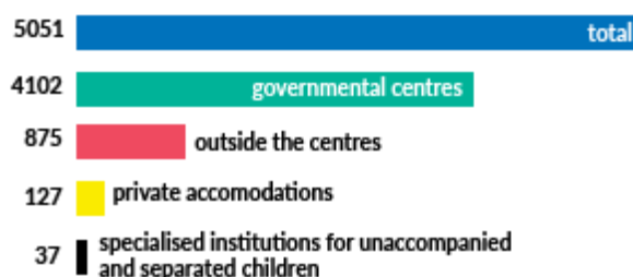
Number of refugees and migrants in the territory of Serbia

In August, the Asylum Office (AO) of the Ministry of Interior of Serbia made no recognitions but rejected two applications by nationals of Cuba and Syria. In August, 237 expressed intention to seek asylum in Serbia and eight submitted actual applications. 1,315 asylum-seekers newly arrived in asylum centres in August, and 1,196 asylum-seekers absconded from them. By end-August, AO has granted subsidiary protection to six and refugee status to three persons in 2021.