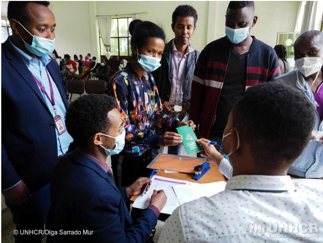
UNHCR and Ethiopian officials register Eritrean refugees in Addis Ababa.