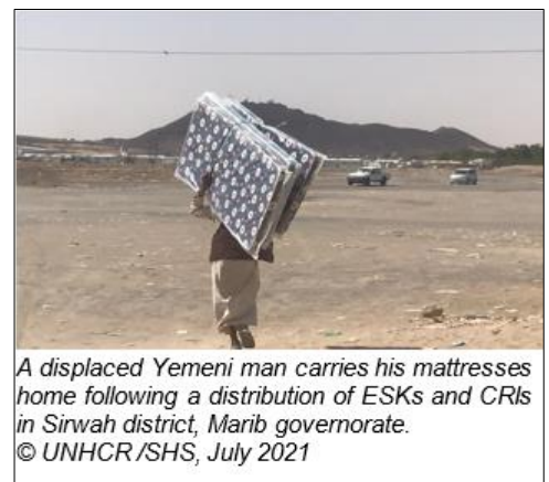
A displaced Yemeni man carries his mattresses home following a distribution of ESKs and CRIs in Sirwah district, Marib governorate. © UNHCR /SHS, July 2021

On 15 July, an interagency assessment mission was carried out with UNDSS, UNICEF, WFP, OCHA, UNHCR and facilitated by the DFA’s Supreme Council for the Coordination of Humanitarian Affairs (SCMCHA) to Al-Jawf governorate. The mission’s goal was to document and lower the security risk level for the areas surveyed—namely Al-Maton and Al-Hazm—from ‘very high’ to ‘high’ and thus open them up for future programming.