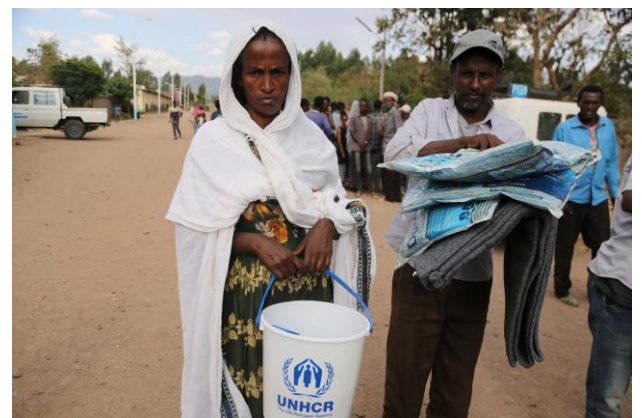
UNHCR distributes vital aid items to internally displaced people in Tigray, including blankets, buckets and sleeping mats.

8 Field Offices in Embamadre, Mekelle, Pugnido, Sherkole, Tongo, Dire Dawa, Bule Hora and Nekemte