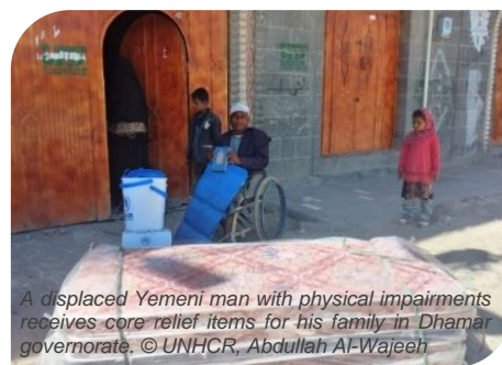
A displaced Yemeni man with physical impairments receives core relief items for his family in Dhamar governorate.

Reports from the field indicate that significant number of IDPs are struggling to cope with colder seasonal conditions. More than one million persons are currently living in IDP hosting sites, many of whom continue to lack access to adequate shelter and basic items. During January, a significant number of IDPs—particularly women, children and the elderly—reported suffering from seasonal illness, fever, chest pain, and other ailments. UNHCR continues to deliver critical core relief items including blankets and stoves, as well as emergency and longer-term shelter kits. In January alone, UNHCR distributed and finalized the construction of over 1,500 Tehama Shelters, benefiting 9,000 displaced Yemenis.