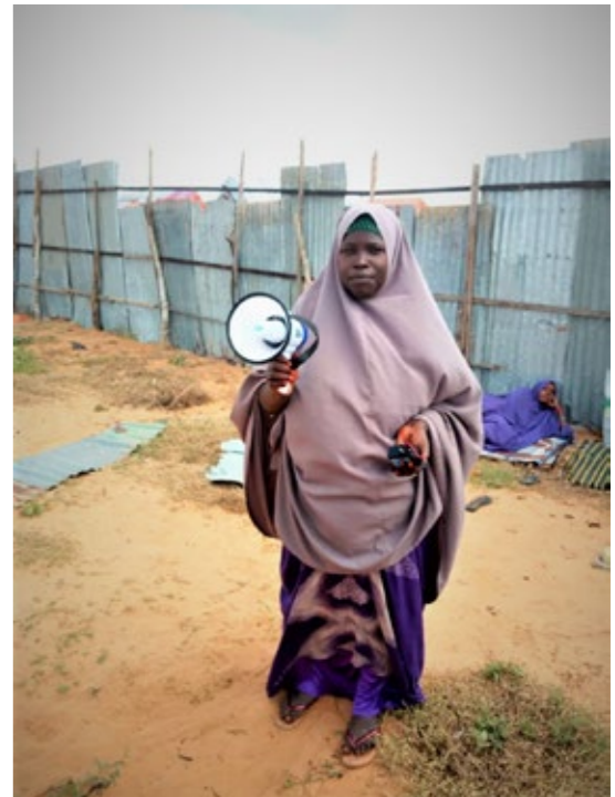
COVID-19 RCCE operations in a Daynile IDP site October 2020

CCCM Cluster Programming in Somalia is funded by: