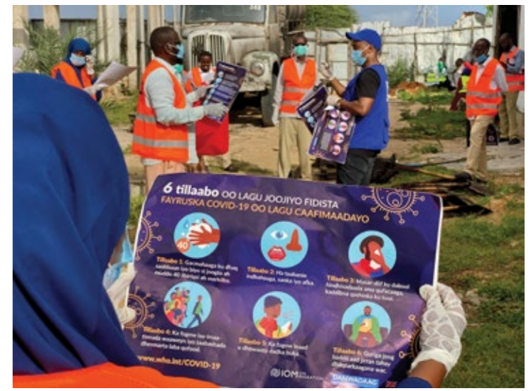
Local hygiene promoters trained on COVID-19 in IDP sites in Banadir

Establishing New Cluster Tools The year of 2020 was made noteworthy through the creation of a number of new CCCM tools. July 2020 saw the CCCM cluster establish a standardized complaints feedback mechanism (CFM) system allowing for all cluster partners to utilize the same mechanism countrywide. The standardized CFM has created evidence-based data used for inter-cluster referrals in addition to fueling the CFM monthly factsheet which showcases complaints trends and sector needs. Tools such as the site verification were greatly enhanced to obtain valuable persons with disabilities (PwDs) data, site-level risks, and settlement density.