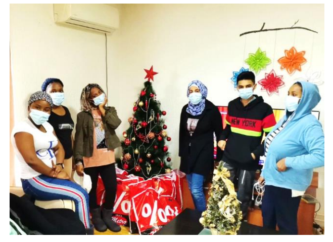
Children accommodated in Loznica Home for UASC were happy to receive New Year's presents, ©UNHCR, December 2020

On 17 December, a riot took place in Bogovada Asylum Centre, which accommodates unaccompanied and separated children (UASC). Luckily, no one was seriously injured, however, as reported by Serbian Commissariat for Refugees and Migration (SCRM), the facility was substantially damaged. The police calmed the situation and 79 UASC were transferred to Preševo Reception/Transit Centre. UNHCR, Indigo and SCRM identified 13 most vulnerable minors and are following up on their needs. On 24 December, the Ombudsman launched an investigation to establish the circumstances of the incident; the following day, the police arrested five Afghan minors for suspected coercion, abuse and damage to reputation on the grounds of religious, ethnic and other affiliation, and for destruction of property. The minors remain in detention pending investigation.