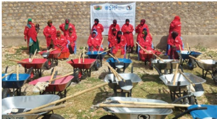
Wheelbarrow distribution for IDP site maintenance activities in Berdale Town. Photo/WRRS/Berdale 2020

CCCM partners responded to the effects of Cyclone Gati in Bari region, planning to reach a total of 26,172 IDP persons in 10 Bossaso IDP sites. Flood response activities include establishing site maintenance activities and engaging with site maintenance committees to rehabilitate communal infrastructures damaged by cyclone.