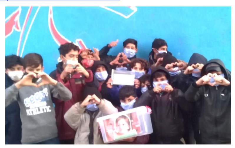
Children in Sombor RTC sending their love to ill children in Serbia, November 2020