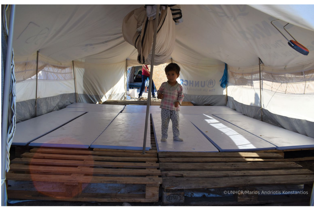
A 5-year-old asylum-seeker from Afghanistan in a tent prior to the installation of wooden flooring at Mavrovouni site, Lesvos.