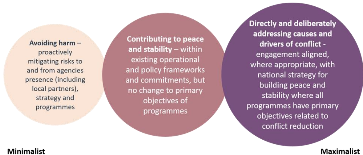
Figure 2: Minimalist-Maximalist approaches

Approaches build on one another. In all cases, the minimum standard of DNH must be met, where conflict-sensitive approaches informed by at least a 'good enough' context and conflict analysis are foundational. Figure 2 outlines minimalist to maximalist approaches for actors working across the HDPN.