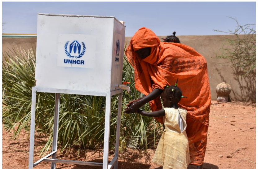
A South Sudanese mother and daughter wash their hands prior to their biometrics being taken in Bileil, Sudan.

In Sudan , while much of the recent activities have been focused on the flood response and related NFI distributions, community sensitization and awareness campaigns on COVID-19 as well as other prevention activities continue through different means, such as mass communication through mobile loudspeakers reaching refugees, IDPs and host communities. Community leaders also continue to be engaged and community awareness on COVID-19 prevention measures has been included in most activities. As an example, on 6 October, Save the Children International, in coordination with UNHCR, the Humanitarian Aid Commission (HAC) and the Ministry of Health initiated community sensitization during NFIs and shelter interventions in Talawdi and Abu Jubayhah localities targeting IDPs.