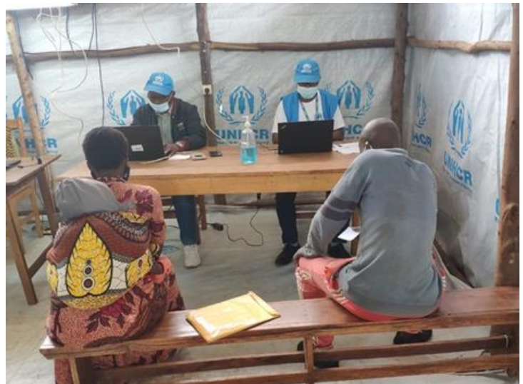
Registration of Burundian refugee returnees from Rwanda at Songore transit centre on 1 October.

The reporting period saw the voluntary repatriation of Burundian refugees from the Democratic Republic of the Congo (DRC) , Rwanda and Tanzania . Between 1-8 October, a total of 3,366 Burundians returned including 312 from the DRC, 1,102 from Rwanda and 1,952 from Tanzania. Additional health screening measures and protocols have been put in place and UNHCR and partners continue to expand the reception capacity at transit centers in Burundi. For example, the construction work to meet COVID-19 requirements at Nyabitare transit centre was completed on 9 October and will allow the reception of at least one weekly convoy out of the two coming from Tanzania. The construction of the isolation centre at Kinazi transit centre is ongoing and will be assigned to receive returnees coming from the DRC.