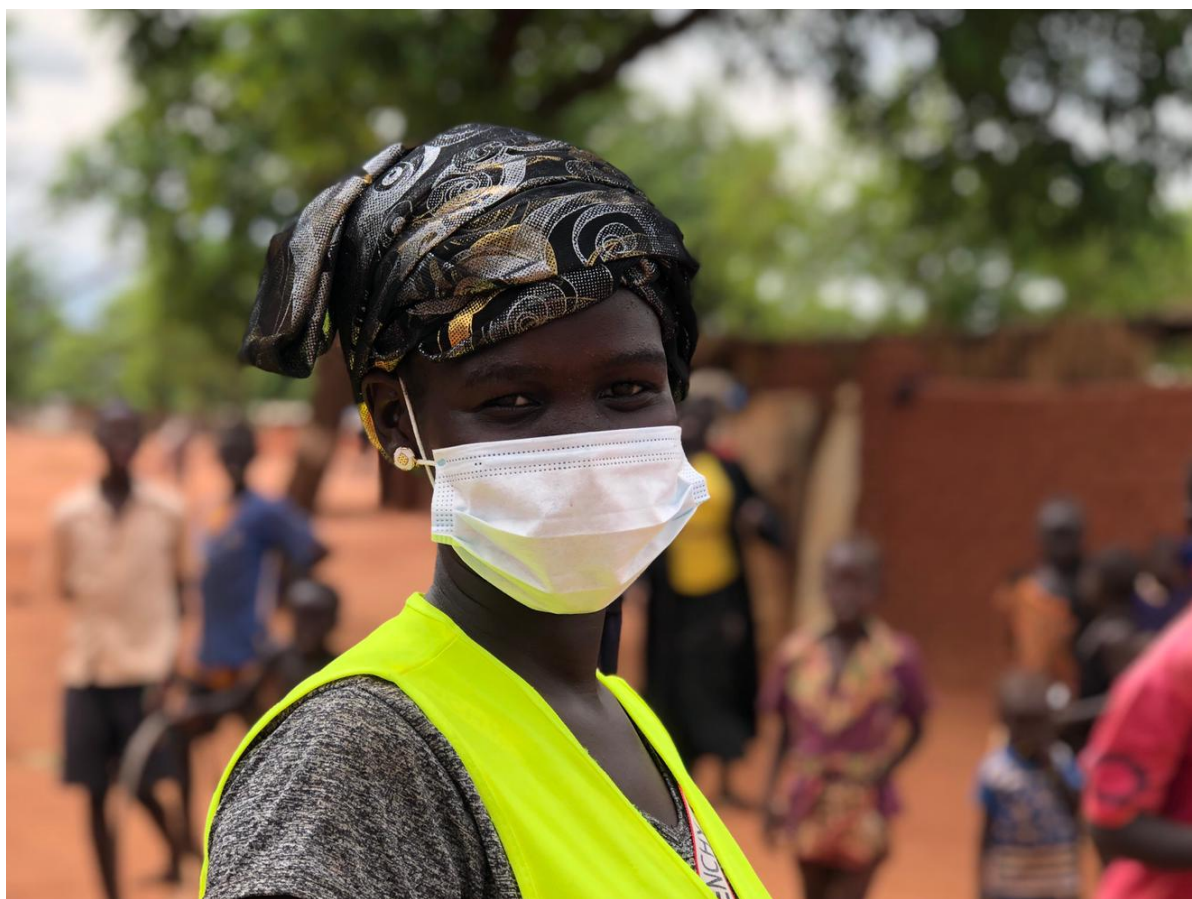
Pamir, Jamjang county