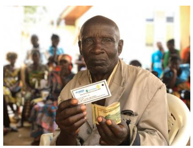
Multipurpose cash assistance for vulnerable households in Beni town, North Kivu Province.

SHELTER AND CRIS UNHCR's partner Caritas completed the construction of 112 additional emergency shelters at the Kigonze displacement site in Bunia, thereby reaching a total of 2,159 shelters built. The shelters are built by workers recruited from displaced and local communities, bringing the communities together and providing important livelihood opportunities.