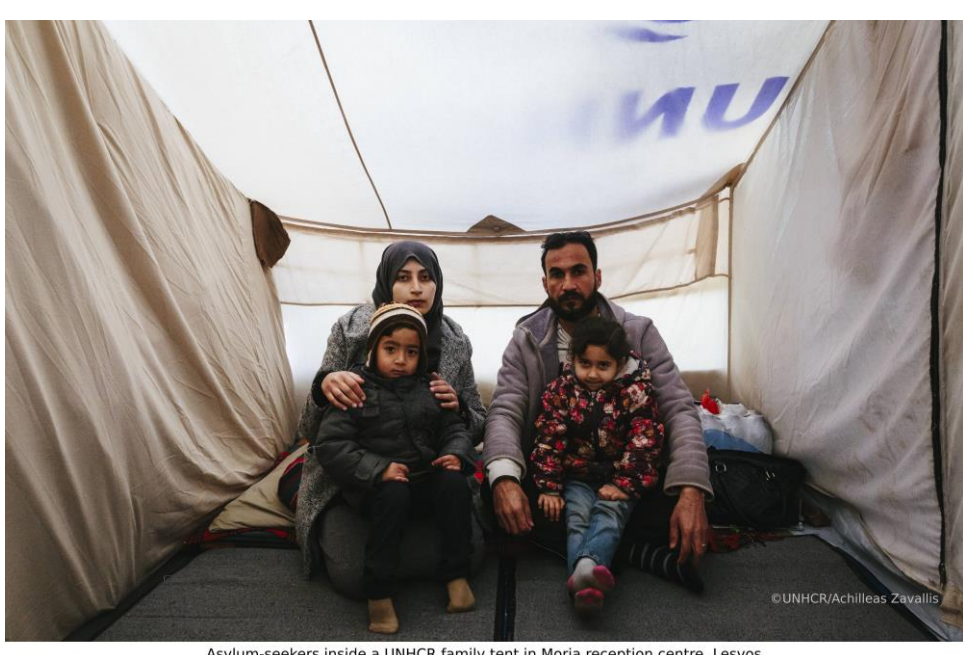
Asylum-seekers inside a UNHCR family tent in Moria reception centre, Lesvos