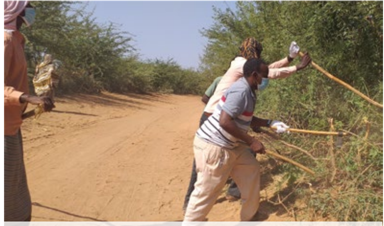
Cash for Work site improvement activities in Luuq, Gedo Region. Photo/DRC/February 2020

CCCM partners with cash for work initiatives rehabilitated a feeder road connecting the IDP sites with host communities in Kismayo. Meanwhile, preparations are underway by CCCM partners to start the site maintenance activities in Mogadishu. This include cash for work activities to improve sites as well as distribution of site maintenance tools