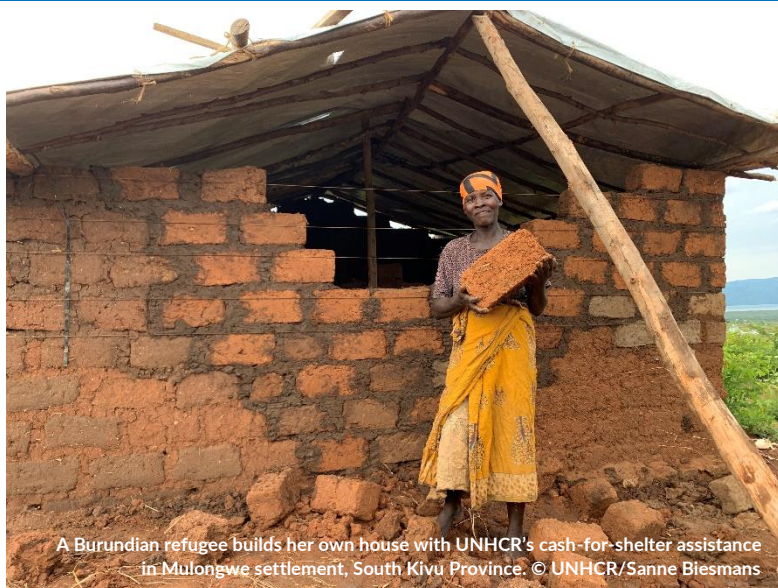
A Burundian refugee builds her own house with UNHCR's cash-for-shelter assistance in Mulongwe settlement, South Kivu Province.

Shelter assistance per type (in % of total households assisted)