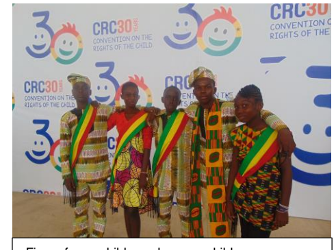
Five refugee children who were child parliamentarians at the first official children's parliament