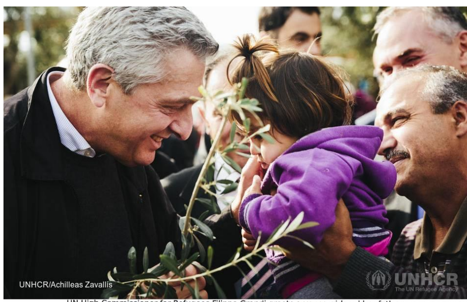
JN High Commissioner for Refugees Filippo Grandi greets a young girl and her father, asylum-seekers living at the Kara Tepe accommodation site in Lesvos.