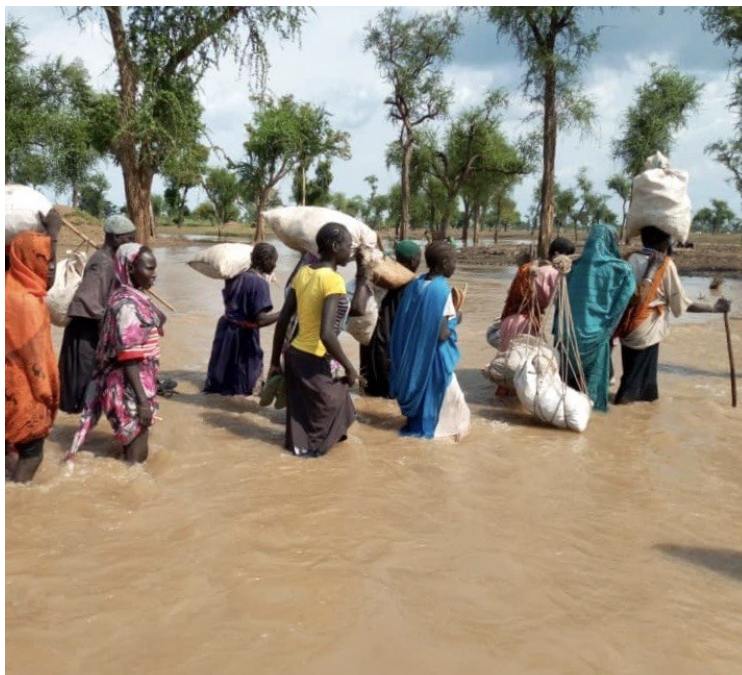
Refugees carry crops they salvaged from their gardens after heavy flooding in Maban, Upper Nile. The gardens are supported by UNHCR.

967 persons of concern reached through child rights and protection campaigns