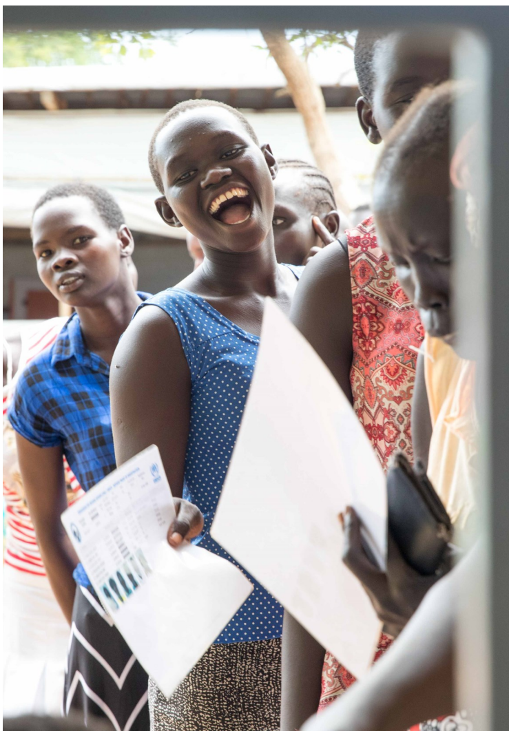
Refugees stand in line at a soap distribution in Gorom Refugee Camp, Central Equatoria, in 2019.

4,912 tree seedlings raised and sold in refugee-run nurseries