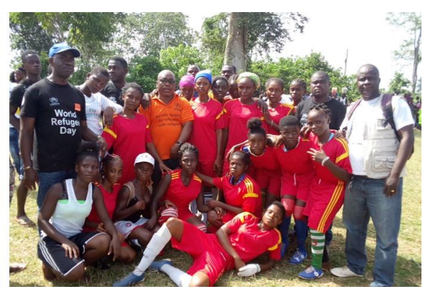
(L) Ivorian refugees in PTP Camp during the parade. (R) Refugees and members of the host communities after the soccer match.