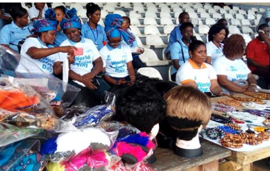
(L) High level participants, including the UN Resident Coordinator (centre), during the WRD celebration in Monrovia. (R) Liberian returnees displayed their products during the celebration.