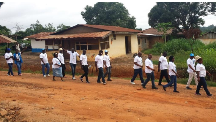
UNHCR colleagues took a step with refugees for more than 5 km in Monrovia and Zwedru.