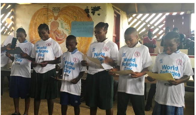
(L) Ivorian refugees led the parade on WRD. (R) Refugee students reading their poems.