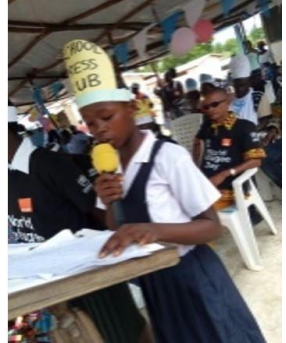
(L) Ivorian refugees in Bahn Camp celebrated WRD through a parade and (R) an indoor programme, including the participation of students and host community members.