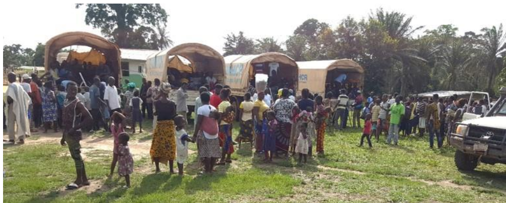
Ivorian refugees in PTP Settlement get on the convoys to return to Cote d'Ivoire.