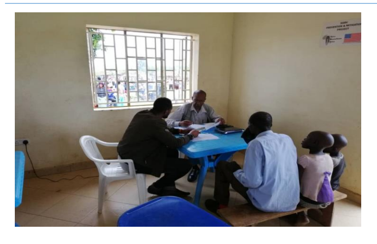
Refugee Eligibility Committee (REC) session in Nakivale settlement