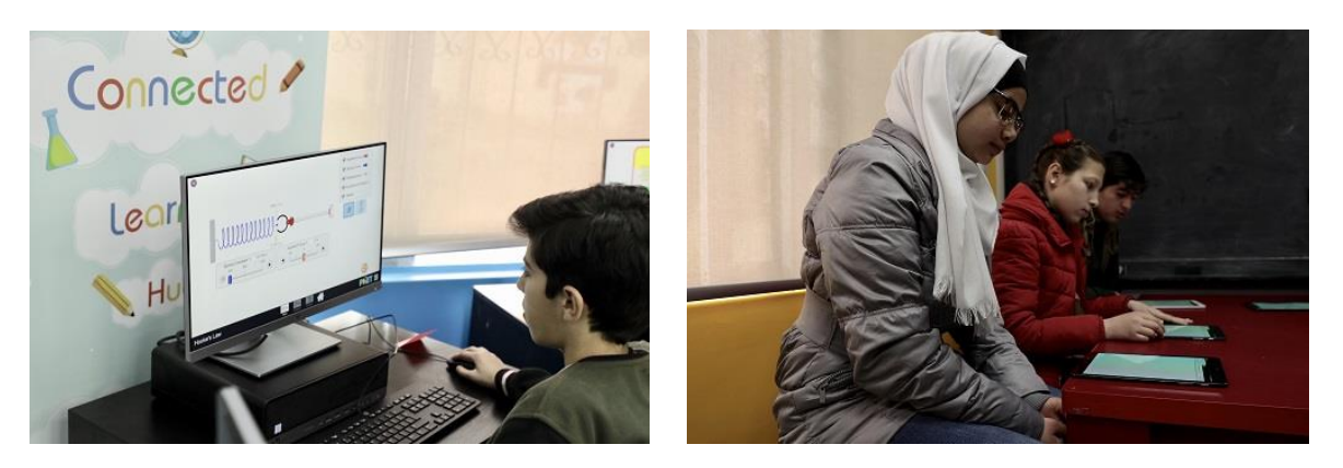
A Connected Learning Hub in Jordan