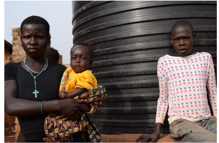
This mother of two [left] arrived in DRC, fleeing fresh violence in South Sudan. Her husband stayed behind with their other child.

Programme (WFP), a contract was signed on 18 February between UNHCR, WFP, the national refugee commission (CNR) and refugee representatives, agreeing that assistance will resume under the condition of staff security, and for a limited time, while UNHCR designs a self-reliance programme.