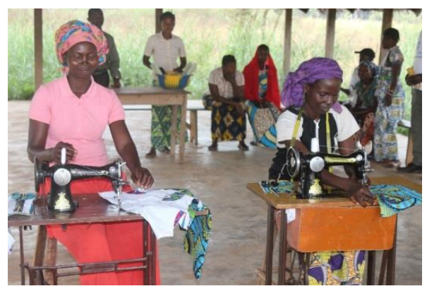
Women sewing at the tailoring centre of Inke camp, Nord Ubangi Province.

Arrivals of Central African refugees slowed down compared to January. 30 crossed into Ndu, Bas Uele Province, DRC, from the Central African Republic, in addition to 235 who crossed in January, according to migration authorities. 65 were awaiting pre-registration, while the remaining 200 already held refugee status from a previous displacement.