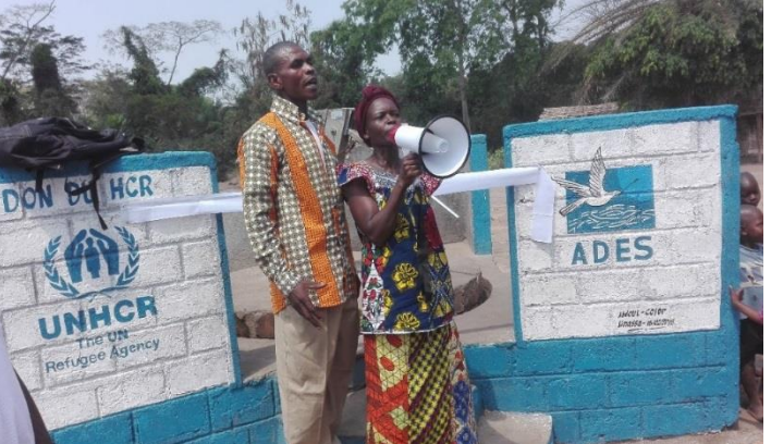
Borehole being handed over by UNHCR's partner ADES in Limasa, Nord Ubangi Province.

■ UNHCR's partner ADSSE distributed 648 packs of Makapad sanitary pads to 312 Central African refugee pupils in Inke camp and 22 local pupils. Sessions will be held monthly on their use and on menstrual hygiene.