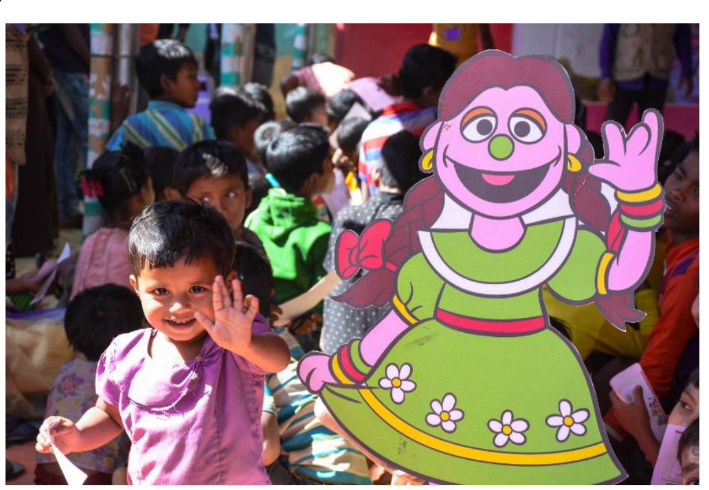
Rohingya children got into the swing of things at the opening of the Sesame Street activities, interacting with life size characters and cut out boards of other characters, as well as games and other educational materials.

Development Centres in Cox's Bazar. The aim is to utilize the Learning Centres and Child Friendly Spaces, working with existing education personnel, to diversify existing teaching methodologies as well as tools available to teachers. The pilot will