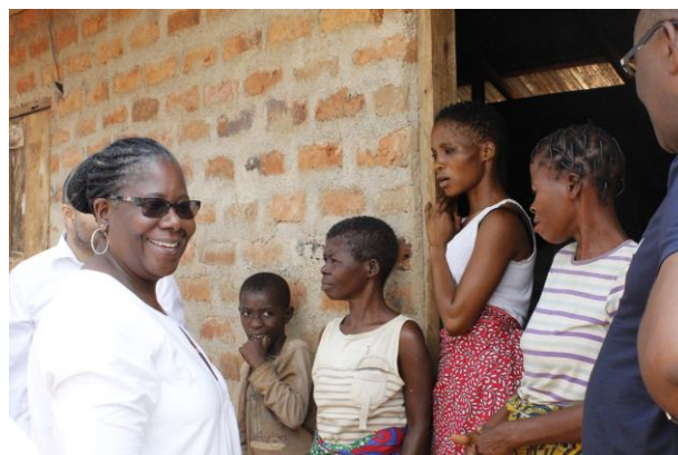
UNHCR Regional Representative with refugees in their permanent shelter in Adagom settlement, Cross River state.

Cameroonian refugees registered in Adagom settlement, Cross River State [as of 30 th November 2018]