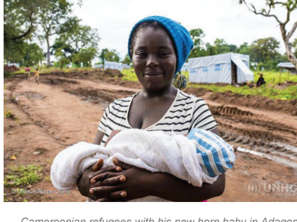
Cameroonian refugees with his new born baby in Adagom settlement.

Cameroonian refugees registered in Adagom settlement, Cross River State [as of 15<sup>th</sup> November 2018]