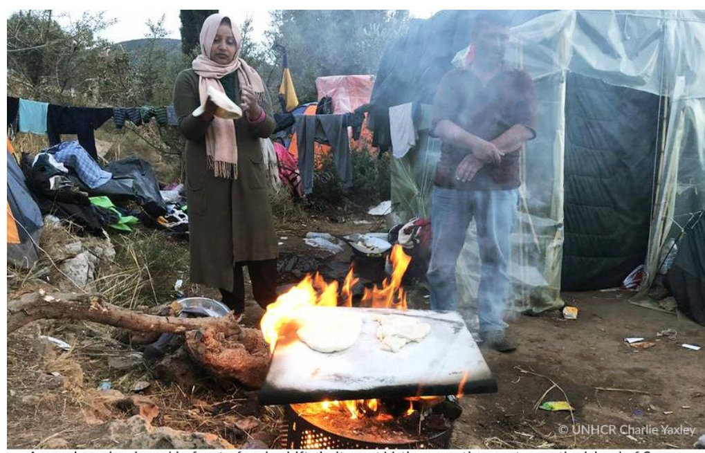
A couple makes bread in front of makeshift shelters at Vathy reception centre on the island of Samos. Asylum-seekers here are struggling to cope with severe overcrowding, dire living conditions and limited access to basic services, including healthcare.