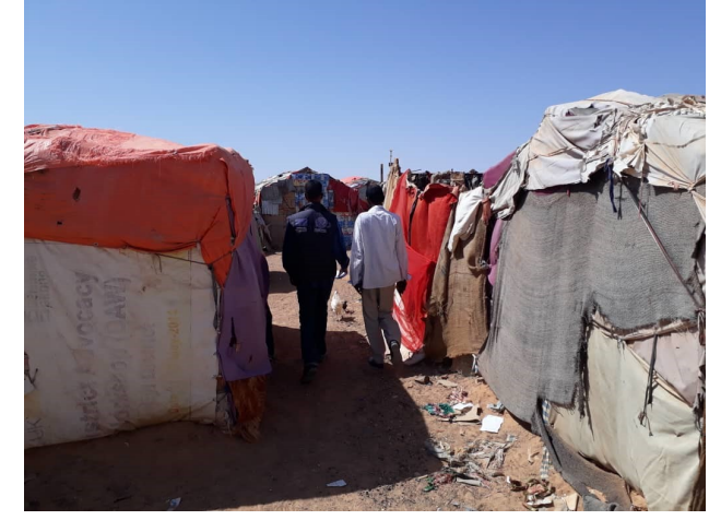
ACTED CCCM Team during a site monitoring visit