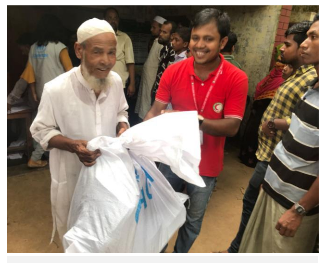
A staff from the Bangladesh Red Crescent Society (BDRCS), UNHCR's partner distributing family kits at a centre in Islampur Union in Cox's Bazar on 3 September.