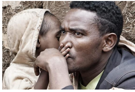
A father and son from south-west Ethiopia arrived at a site for internally displaced persons in Gedeb. Over one million Ethiopians have been displaced due to renewed violence in the Oromia and SNNP regions.