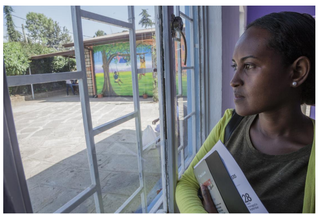
Eritrean refugee looking out the window at a Jesuit Refugee Service Child Protection Centre in Addis Ababa.

The leaders of Eritrea and Ethiopia signed a peace agreement on the 9<sup>th</sup> of July. This happened at the conclusion of an unprecedented summit between the two countries focused on normalizing relations after two decades of conflict.