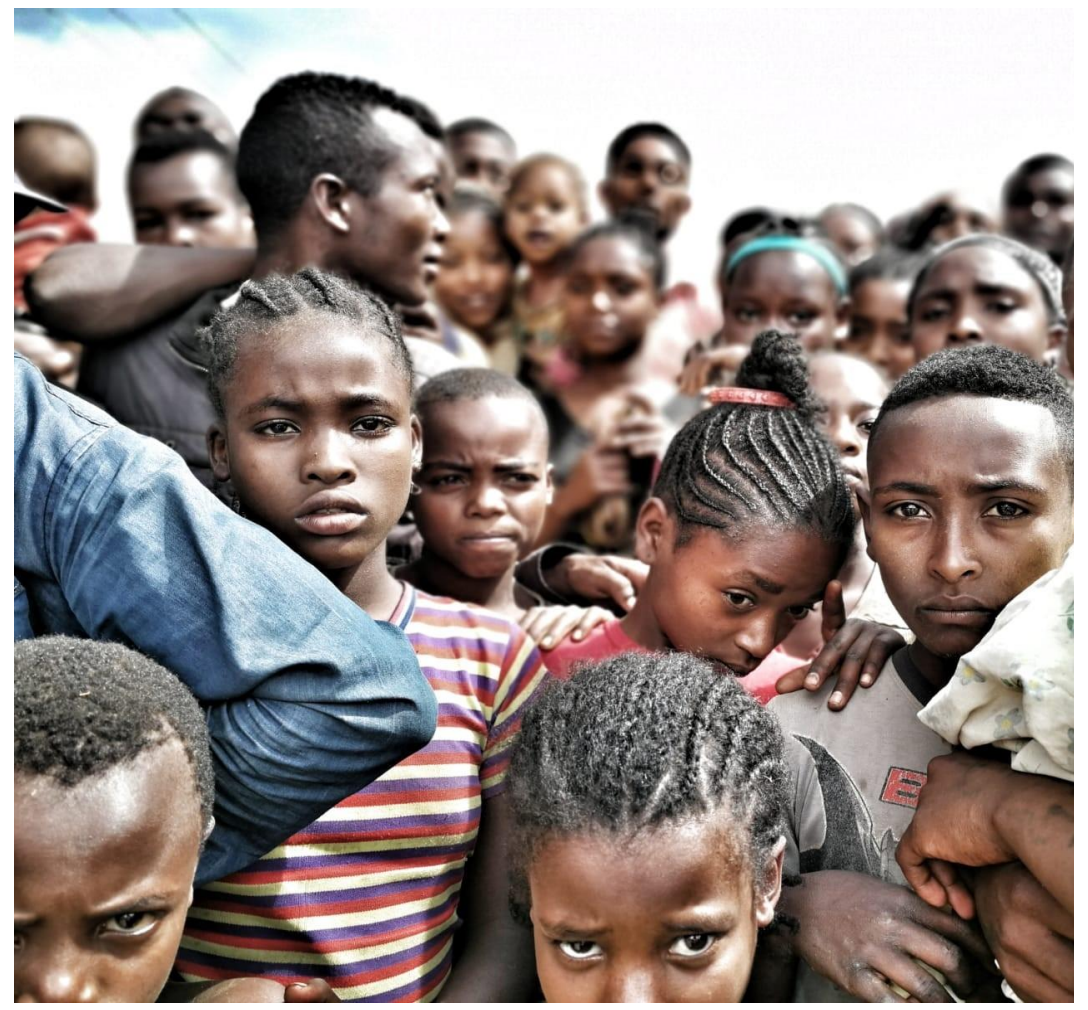
Faces of people forced to flee due to renewed violence in the Oromia and SNNP regions.

The Government of Ethiopia and humanitarian partners require a total of USD 117.7 million to scale up their response to the most recent round of internal displacement.