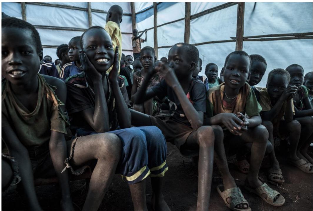
South Sudanese refugee children attending a newly opened school in Gure Shombola Camp

In July, data on refugee education was published as a sub-sector within the Ministry of Education's (MoE) Education Statistics Annual Abstract Report for 2016/17 academic year. The publication entails information on pre-primary, primary and secondary school enrolment as well as other key education indicators.