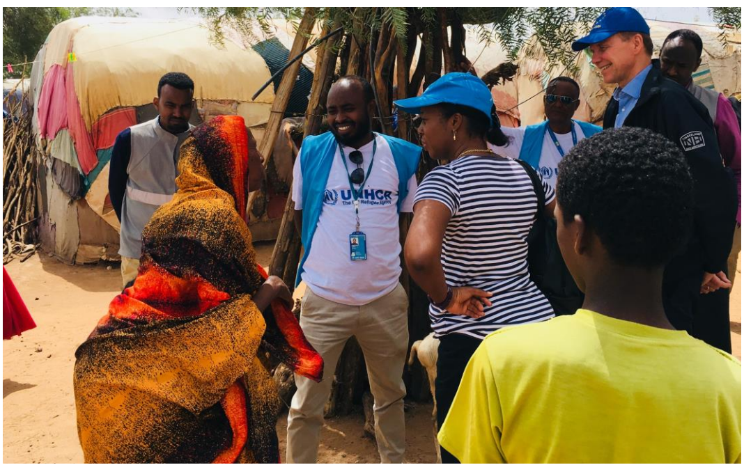
Mission by UNHCR and EU to Jijiga.

On the 19<sup>th</sup> of July, the Delegation of the European Union to Ethiopia and UNHCR signed a contribution of EUR 4.2 million towards the Comprehensive Refugee Response Framework (CRRF). The funds will target capacity building and technical assistance to the CRRF structures and Ethiopian government institutions.