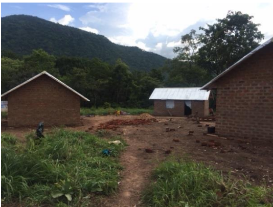
Completed shelters in Anyake Settlement, Benue State