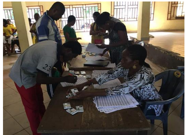
Cameroonian refugees receiving their ID Cards in Ikom, Cross River State

Cameroonian refugees living in Anyake settlement, Benue State [as of 15 July 2018]