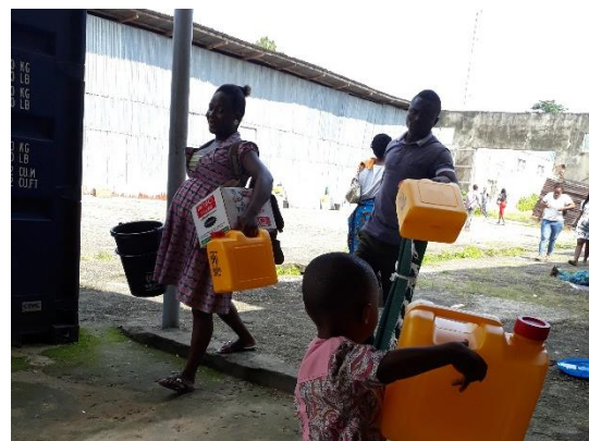
Cameroonian refugees received food and non- food items in Calabar, Cross River State