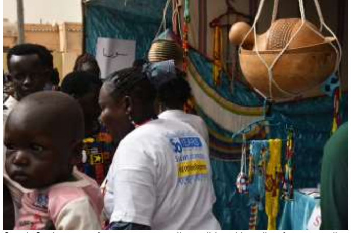
South Sudanese refugee woman sells traditional handicrafts at a stall at As Saha El Shabia stadium in Khartoum during the World Refugee Day celebration on 30 June.

WORLD REFUGEE DAY COMMEMORATION ACROSS SUDAN – UNHCR commemorated 2018 World Refugee Day 2018 across all States hosting refugees in a series of joint events with the Commissioner for Refugees (COR). The events brought together refugee men, women, girls and boys of all ages from South Sudan, Ethiopia, Eritrea, Syria, Yemen, Democratic Republic of Congo (DRC) and Central African Republic (CAR) through activities that involved sports and cultural presentations, as well as displays of traditional items, food and music. The events were also an opportunity to mark 50 years of UNHCR's work in Sudan.