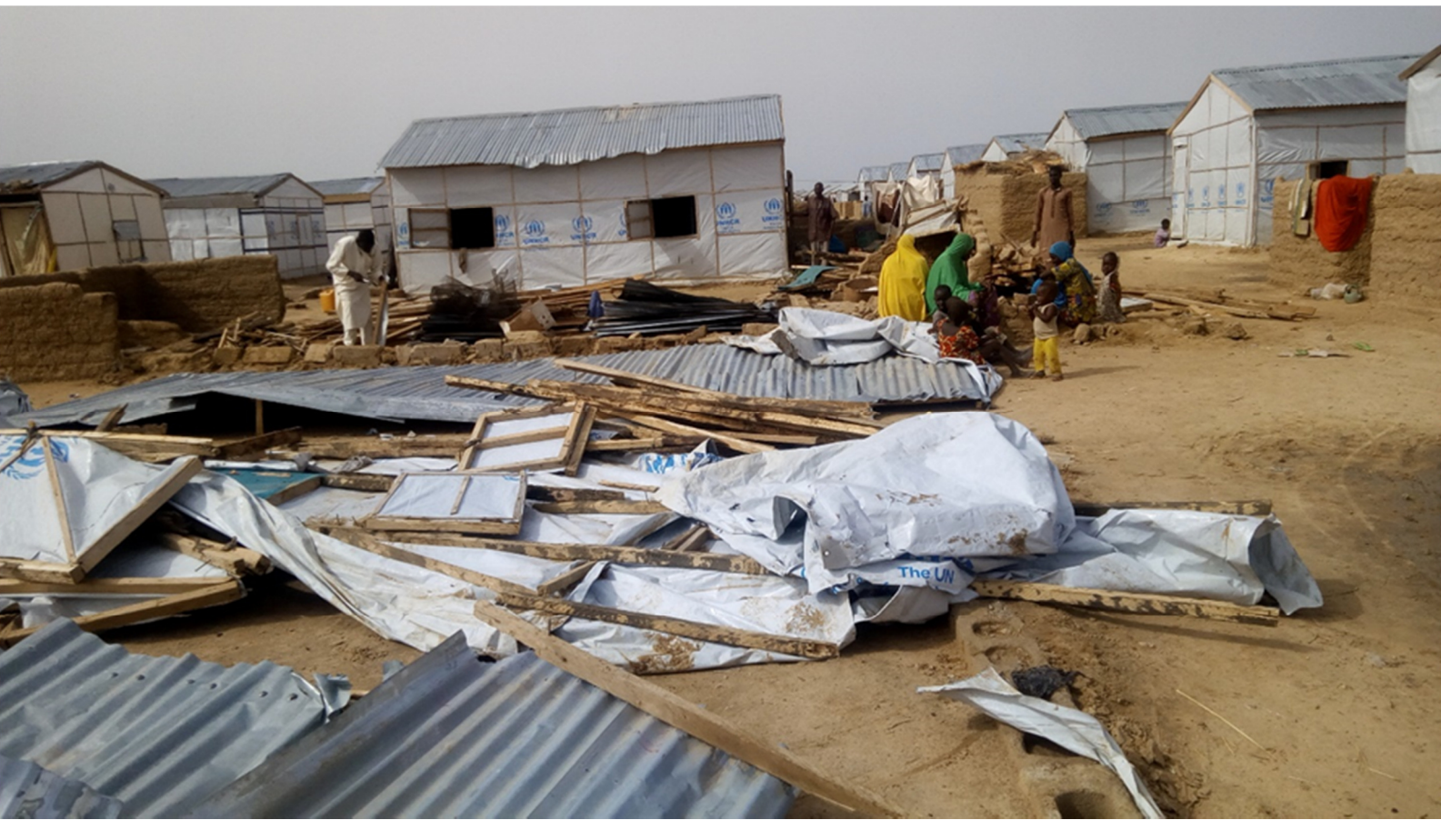
SHELTERS AFFECTED AS A RESULT THE RAINS AND WINDSTORM IN BAKASSI CAMP® SAHEI. MAY 2018