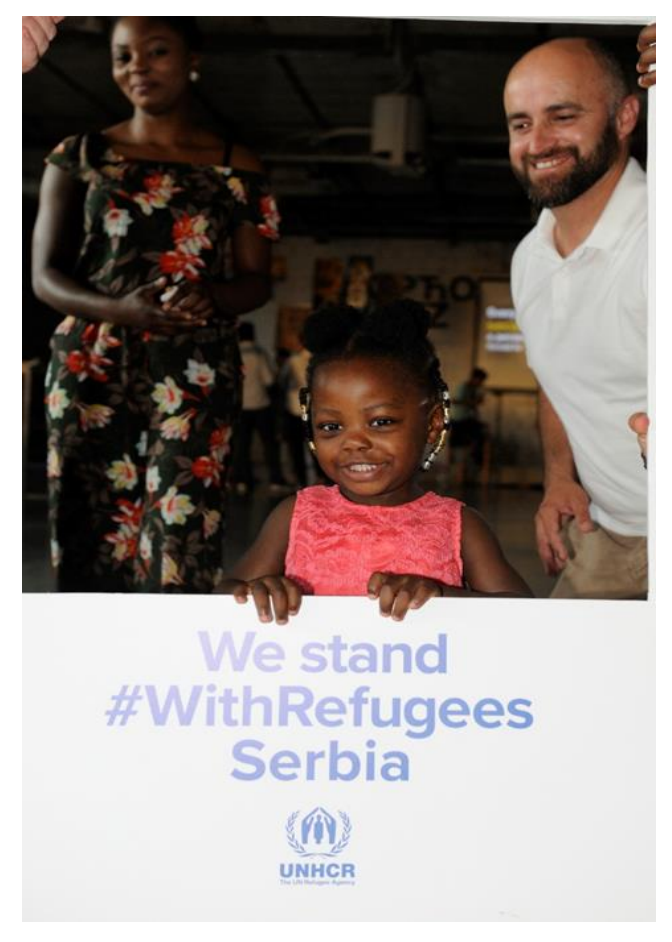
Refugees and helpers marked World Refugee Day. © UNHCR, Belgrade, 20 June 2018