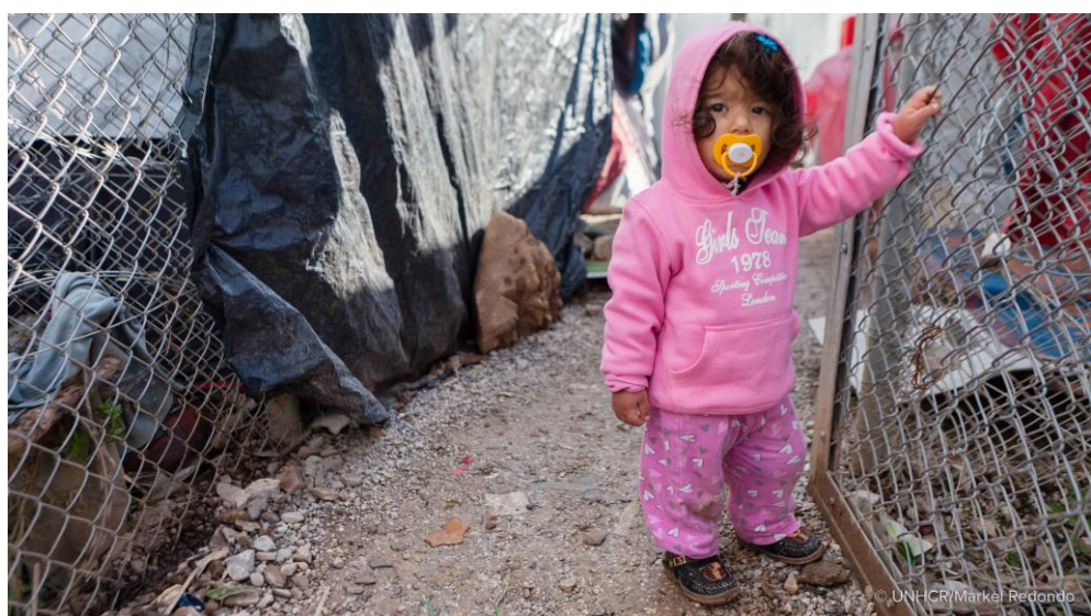
A girl at Vathy reception centre on the island of Samos, Greece.