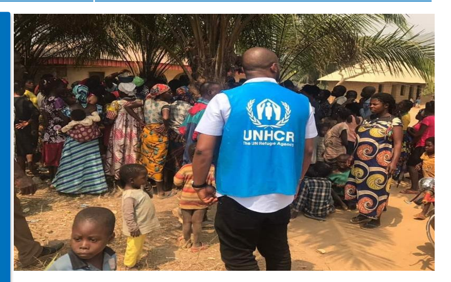
UNHCR staff engaging with Cameroonian refugees in Cross River state.