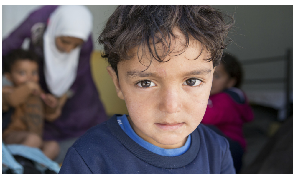
Refugees and asylum-seekers face overcrowded conditions on the island of Lesvos.