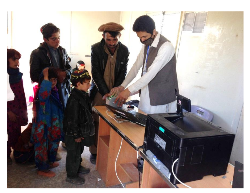
Photo 1 Biometric registration conducted in Khost in 2017