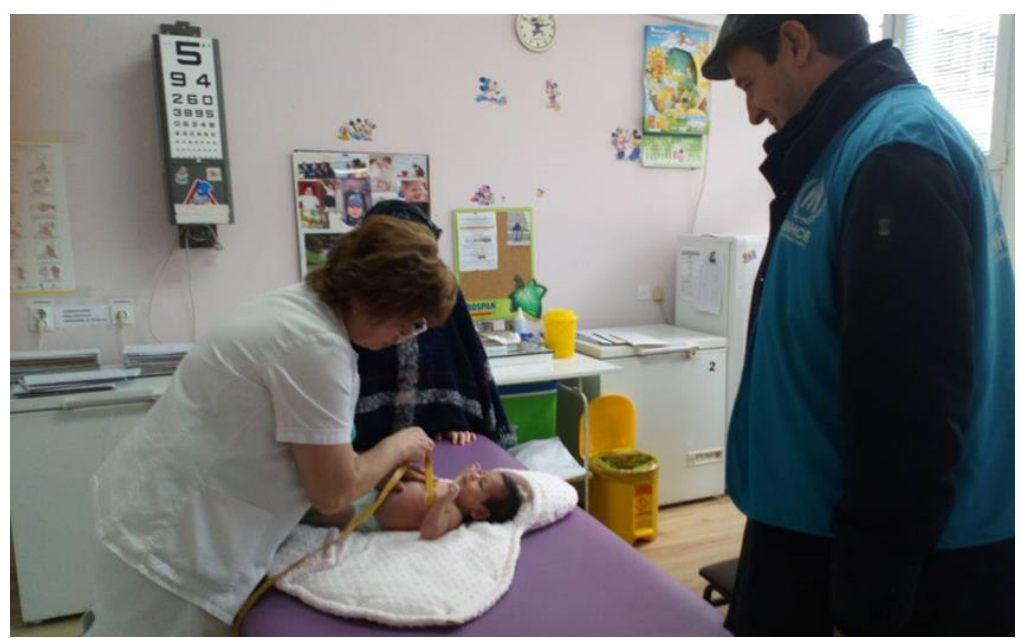
A partner of UNHCR supports the medical check of a refugee baby with transport to and translation at the Subotica hospital, Subotica (Serbia), 29 January 2018