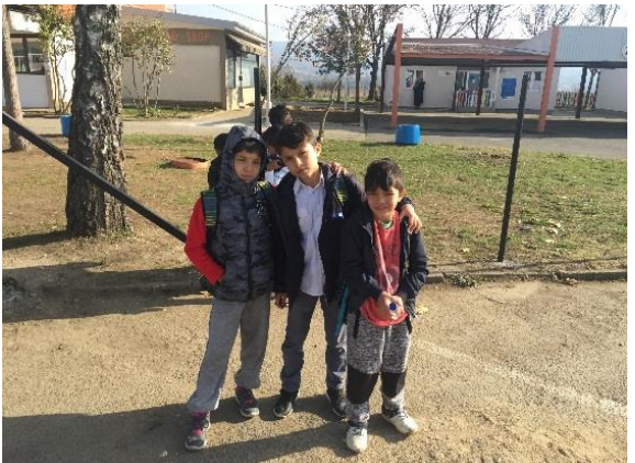
Schoolboys from Vranje RC (Serbia), @UNHCR, 06 Nov 2017

598 refugees, asylum-seekers and migrants were accommodated in the three Reception Centres of Presevo (306), Vranje (118) and Bujanovac (174), including 58 unaccompanied or separated children (UASC).