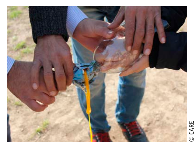
Information Volunteers demonstrate the risks of child birth by girls with under-developed pelvises by attempting to push a wrapped up egg through a bottle.

child marriage and protecting those at risk. It also calls on states to ensure that marriage is entered into only with the informed, free and full consent of the intending spouses.