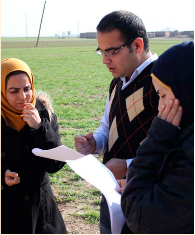
Photos (left to right): Information Volunteers working together to plan strategies and messages for influencing people in their community; Information Volunteers reviewing information on early child marriage in preparation for community outreach; Information Volunteers rehearsing a drama about child marriage.

are skills which they can take back to Kobane when the time comes to return, and thus we expect that this simple programme will have longer-term lasting impact – certainly on the lives of the girls who will now not be forced into marriage.